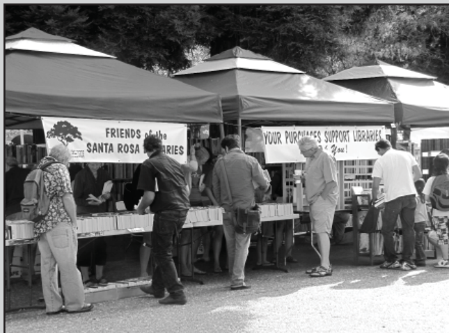
Book lovers gather at the Friends' tents during last month's Sonoma County Book Faire in downtown Santa Rosa's Old Courthouse Square.

You see, Reading Tree is a project of a Washington state-based corporation called Thrift Recycling Management (TRM), and put simply, only a small percentage of books donated in the bins go to charities. TRM sells books with value on their web-based retail sites and the vast majority of books are sold